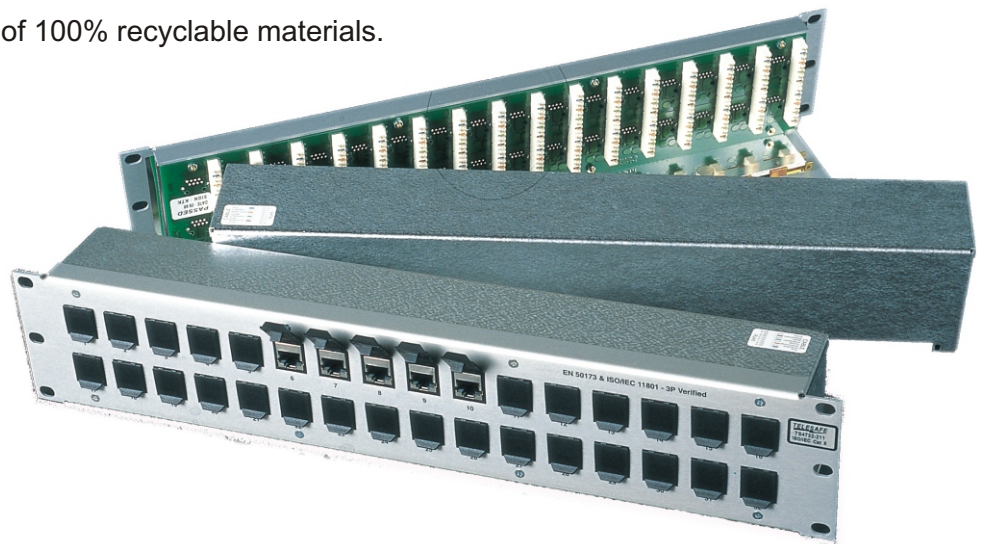
32-ports shielded patch panel with dustcovers 5732-211