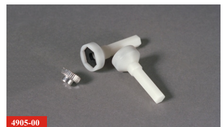
4905-00 Tool for fingerscrews

For ordering information and electrical parameters, see next page