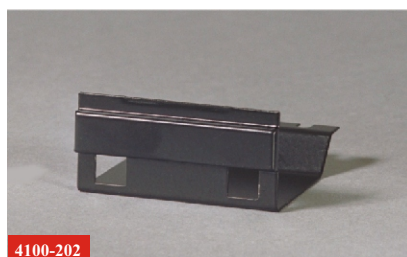
4100-202 Cover plate, black